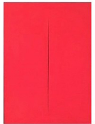
Lucio Fontana Concetttop Spaziale, 'Attese'